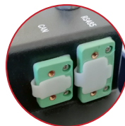
4.CANBUS - RS485